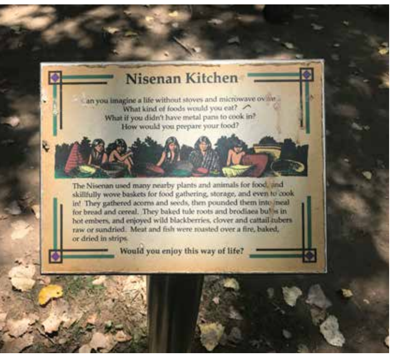
TOP Fire pit replica at the Effie Yeaw Nature Center. Photo Credit: MIG BOTTOM Interpretive Nisenan kitchen placard at the Effie Yeaw Nature Center. Photo Credit: MIG