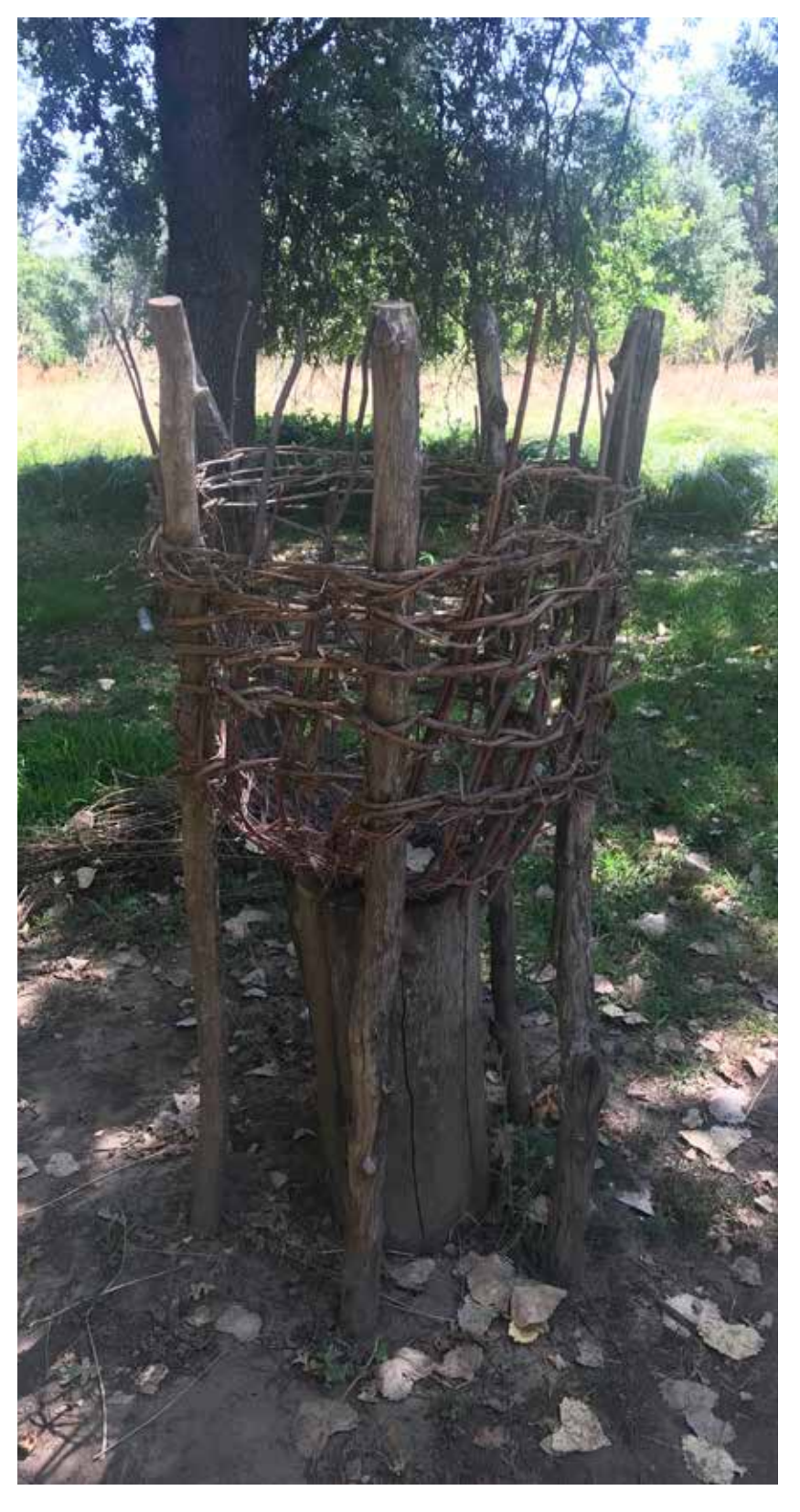
Acorn granary replica at the Effie Yeaw Nature Center.

historic structures or buildings. Of note is the Folsom Mining District, listed as a historic archaeological resource comprising multiple sub-sites (i.e., foci) within a large area. The CHRIS search identified 18 archaeological resources fully outside the Parkway, but located within 0.25-mile of the Parkway boundary (eight are prehistoric archaeological resources, three are combined prehistoric/historic archaeological sites, and seven are historic period archaeological resources). A historic landmark resource (Five Mile House) in the study was also included in the CHRIS search from the NCIC.