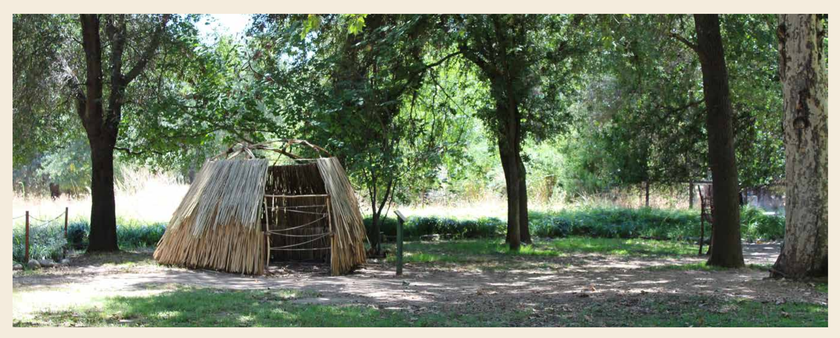
Tule hut replica at the Effie Yeaw Nature Center.

Gold rush activities in the Parkway were most rigorous between 1847 and 1859. Mine tailing and dredging remains characterize these resources, as well as remnant structures, foundations, walls, and placer mining materials. Industrial activities began in the Parkway in the midnineteenth century and related impacts continue to affect the Parkway today. Industrial resources include historic railroads, bridges, utilities, and major structures; as well as other historic period structures and residences that embody a past architectural style.