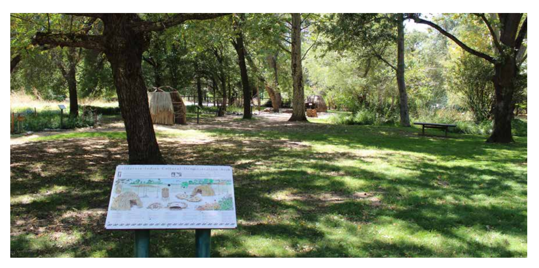
The California Indian Cultural Demonstration Area at the Effie Yeaw Center.