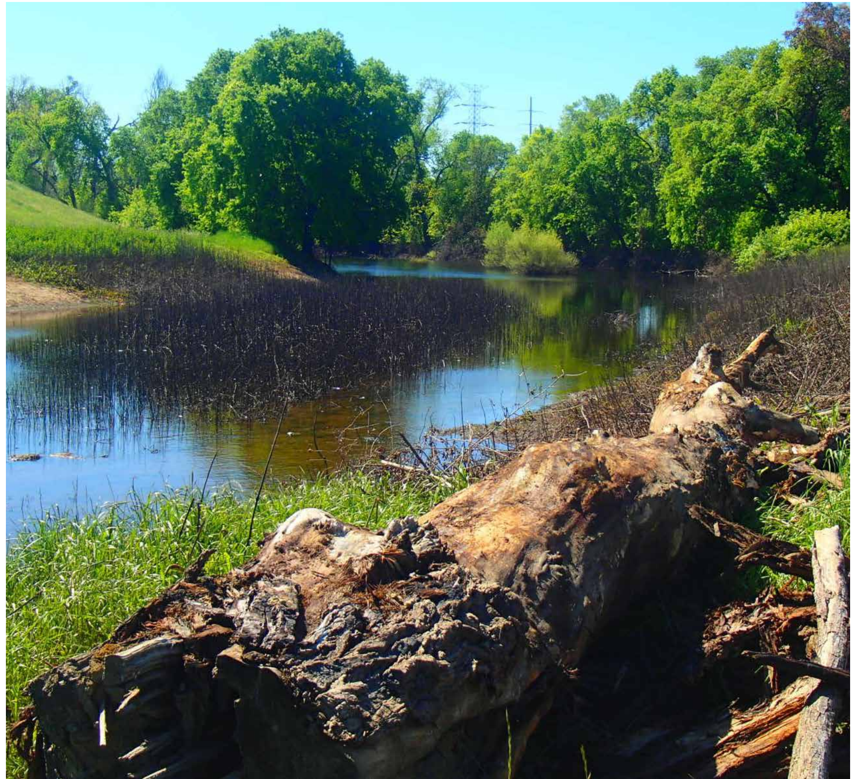
Levee borrow pit in the Discovery Park Area between River Mile 12 and the Sacramento Northern Bike Trail.