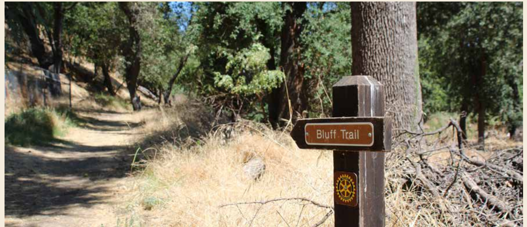
TOP LEFT Aerial view of a parking lot and the Howe Avenue Bridge in the Howe Avenue Area. Photo Credit: John Hannon. TOP RIGHT Bikers on the Jedediah Smith Memorial Trail in the Discovery Park Area. Photo Credit: MIG. BOTTOM LEFT Accessible ramp to fishing platform in the Arden Bar Area. Photo Credit: MIG. BOTTOM RIGHT Foot trail and trailhead in the Ancil Hoffman County Park Area. Photo Credit: MIG.