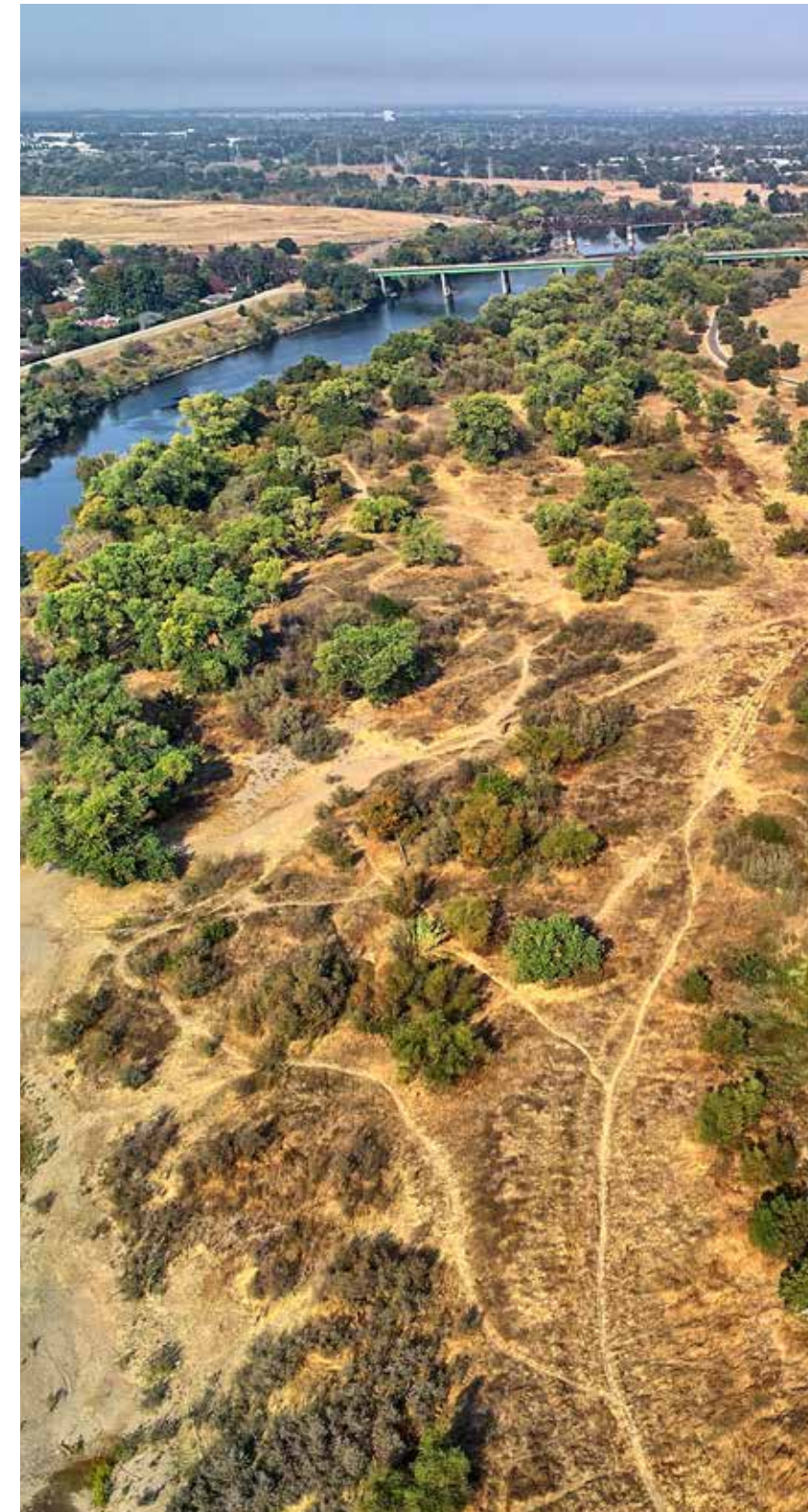
Aerial view of network of social trails in the Cal Expo Area.

The State and Federal WSRA effect how Parkway resources are managed by requiring activities must not adversely impact the Parkway’s recreation and fishery values. As a political subdivision of the State of California, Sacramento County has principal administrative and management responsibility for the designated portion of the Parkway (Parkway Plan 2008). As a result, Regional Parks is responsible for ensuring projects in the Parkway do not adversely impact recreational opportunities, fishery values, water quality, or the free-flowing condition of the river and the Parkway.